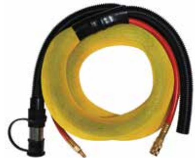
Air/Vac Work Hose Conductive / All Brass Fittings