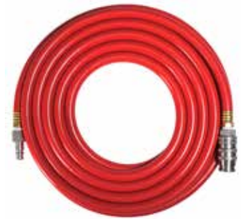
Compressed Air Line Conductive / All Stainless Steel Fittings