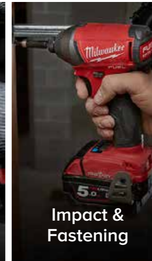
Impact & Fastening