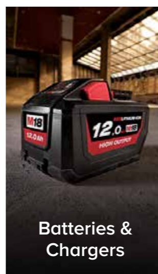
Batteries & Chargers