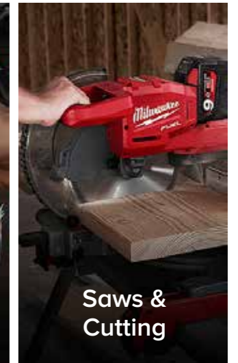
Saws & Cutting