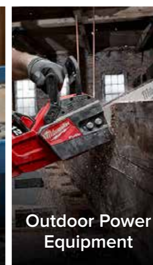
Outdoor Power Equipment