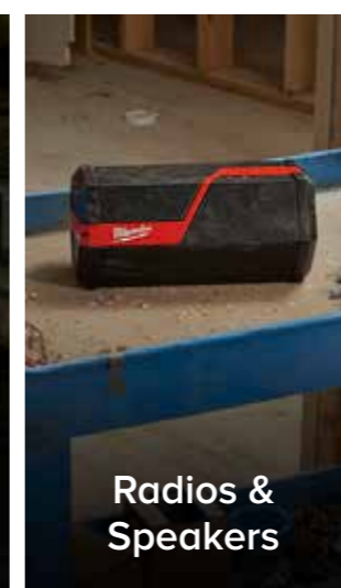
Radios & Speakers