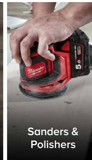
Sanders & Polishers